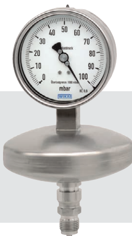
Model 532.51 – 532.54