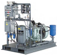
High Pressure Nitrogen System