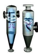
Gas Liquid Separators