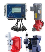
Pumps and Controls